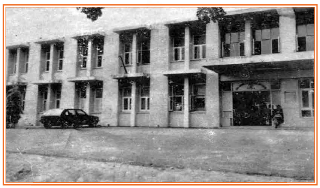
College in 1995-96