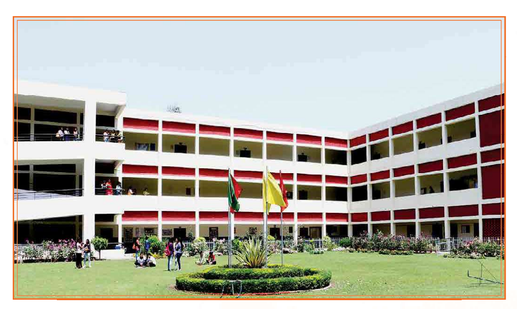
College in 2022-23