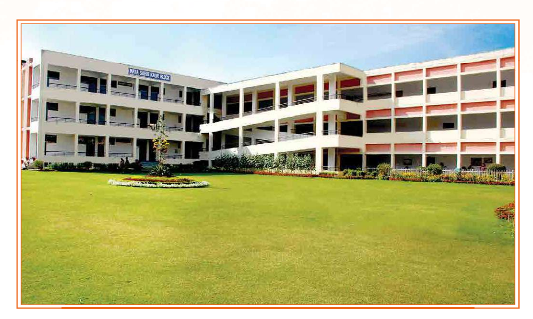
College in 2018-19